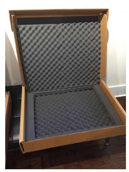
Now notice we have carved out a custom-size "box" to safely nest your artwork. [above]

And now we are ready to close up the box and go - We ship by UPS or FedEx Ground [right]